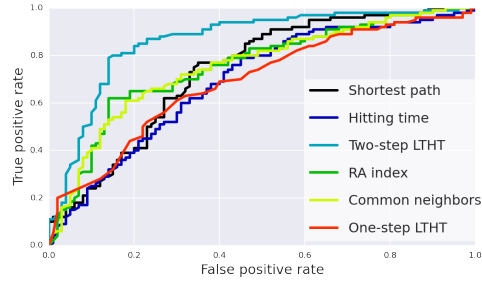
Figure 3: The two-step LTHT (Theorem 4.8) performs best at word similarity estimation.

Proof. Let P_{ij}(t) be the probability of going from x_i to x_j in t steps, and H_{ij}(t) the probability of not hitting before time t . Factoring the two-step hitting time yields